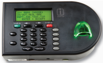
*V850 requires TimeForce Job Costing module.

The NXG G2 user interface and touch screen will engage employees, shorten the learning curve and reduce data input errors. It supports all badge formats (bar code, magnetic or proximity), has two USB ports and ethernet connectivity and was designed specifically to integrate seamlessly with iSolved TimeForce!