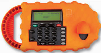
*V850R requires TimeForce Job Costing module.

No cards to carry or lose. Our fast, award-winning clocks in our Velocity Series are biometric and use a one-to-one scan of an employee's finger to clock in and out - eliminating buddy punching. The V850 has the additional functionality of job costing and departmental transfers.